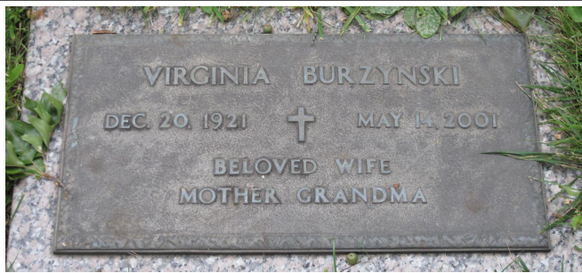
Burzynski Virginia 148'e s73e18